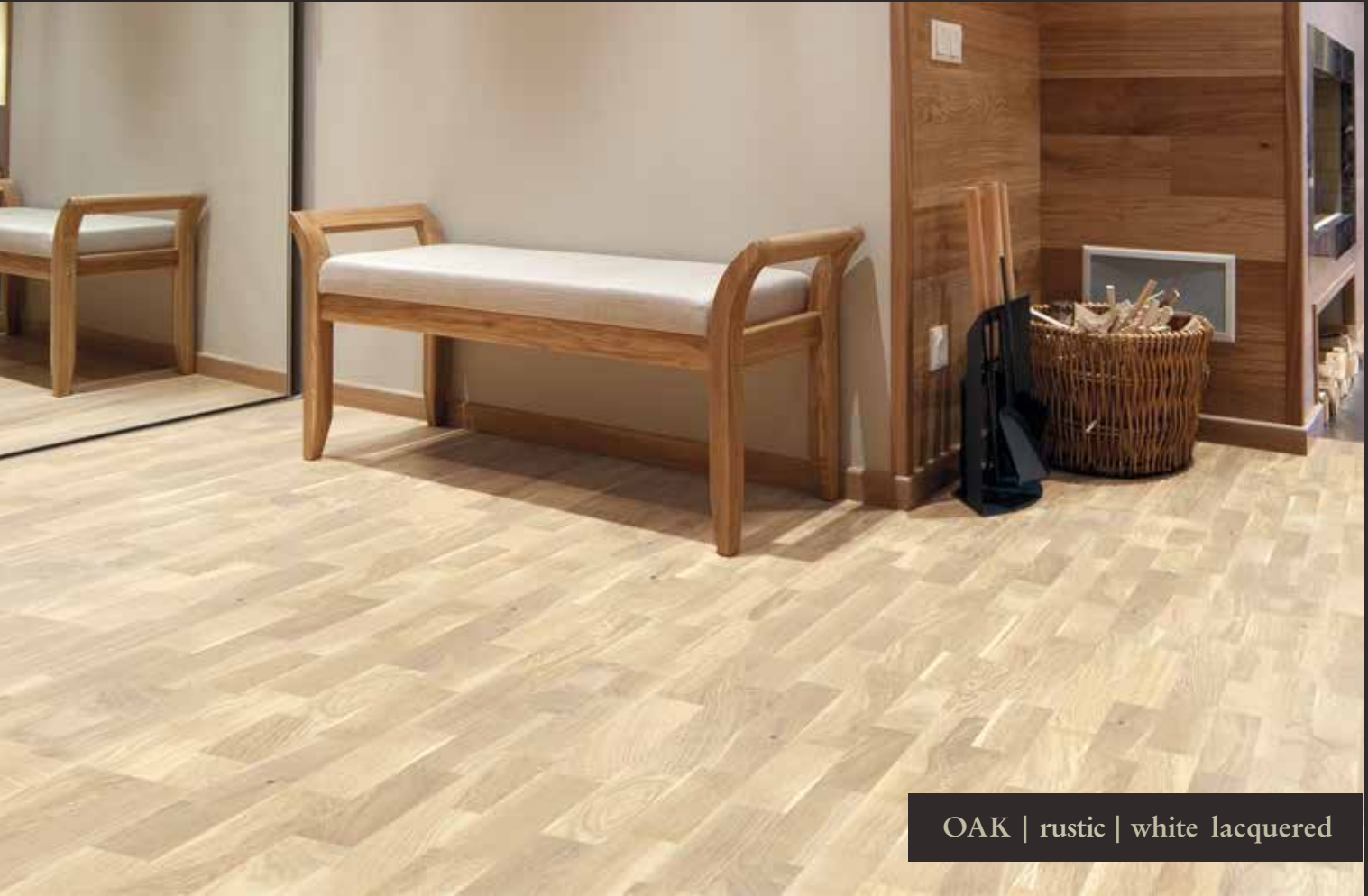
OAK | rustic | white lacquered