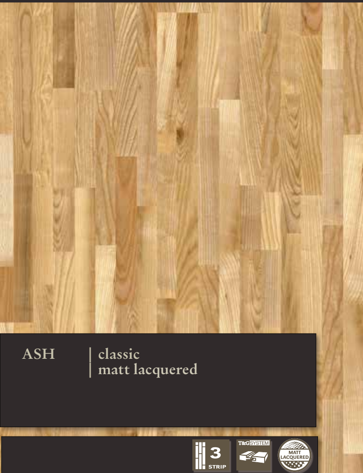
ASH | classic matt lacquered